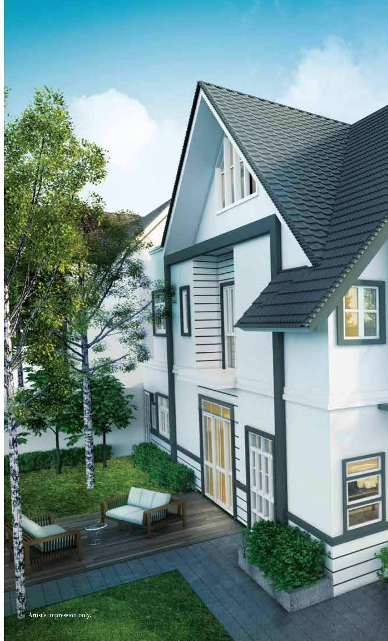
Artist's impression only.

At the heart of it all, is a lovely, luxury residence, laden with classic Tudor architecture elements and modern opulence.