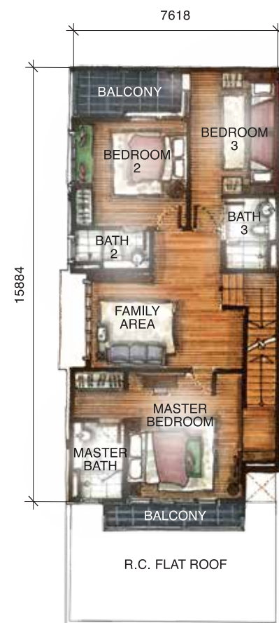
First Floor (With Attic)